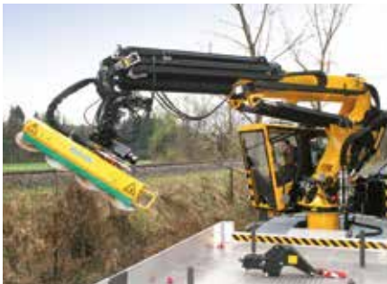
Branch saws To cut the structural clearance outline along the line Branch saws or even branch shears allow the clearance outline to be cut. The cabin offers optimum protection for the operator.