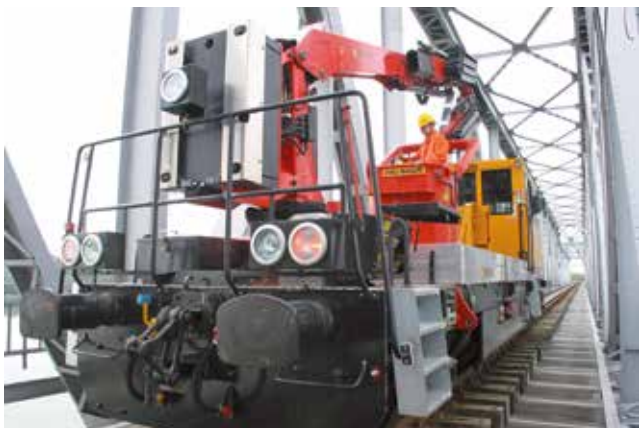
Different bridge designs PALFINGER bridge inspection systems also allow bridges with unusual designs to be inspected. Drawing on many years of experience, PALFINGER bridge inspection systems have a functional design and are equipped with state-of-the-art technology, making them the perfect partner for challenging bridges.