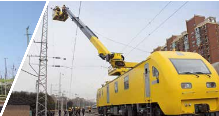
PA360 & PA95 & PFD99 in China