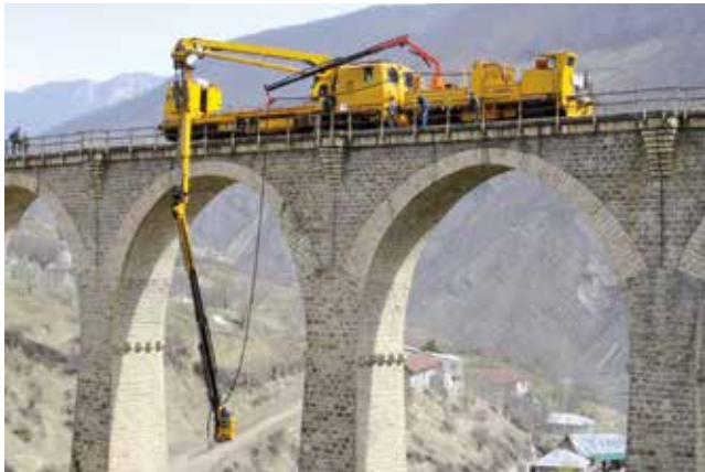
Bridge maintenance Thanks to perfectly matched equipment, routine bridge maintenance can be performed without any problems.

Proven capability on numerous railway vehicles, road/rail vehicles and wagons over many years. Exceptionally large working range below and above rail level.