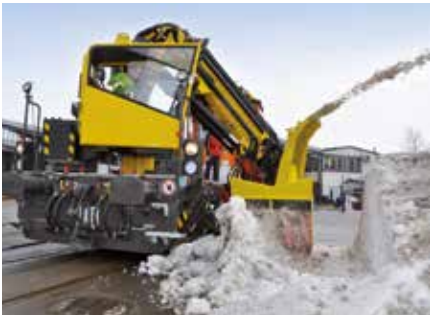
Snow blowers To clear areas of snow Snow blowers fitted on the crane boom enable surfaces and paths alongside the vehicle to be cleared.