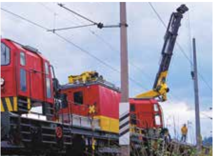
Cable winches To improve handling of parts Cable winches facilitate the handling of bulky parts, for example installing masts below existing catenary systems.