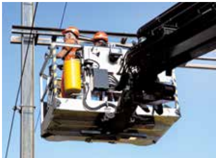
Workman baskets For working on overhead wiring Workman baskets are an ideal tool, especially for working on catenary systems. Fixed or slewable workman baskets are used depending on the field of application.