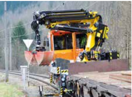
Clamshell buckets Turn a crane into a versatile machine The universal clamshell bucket is ideal for day-to-day digging and loading applications.