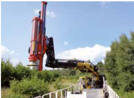
Pile drivers To drive mast foundations into position Various types of pile drivers (impact or vibration type) can be fitted to suitable crane models to ram mast foundations into position.