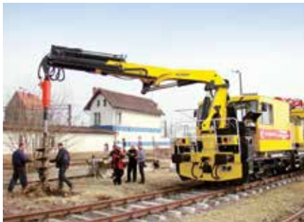
Augers To prepare mast foundation holes Ideal for preparing foundations for masts of overhead cables and signaling systems. The augers are available in different diameters.