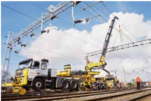
Complex challenges This crane type is right at home in this environment where overhead lines make access difficult. Thanks to its special reverse outer boom, this crane can demonstrate its strengths to the full.