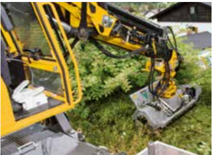
Mulchers To remove vegetation along the line The use of mulchers to remove vegetation is both efficient and environmentally friendly.