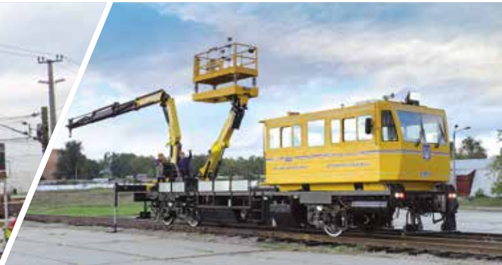
PA120 & PK26502 in the Ukraine