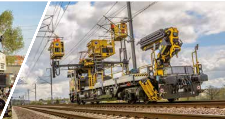
PA1002 & PR220 & PFD99 in Luxembourg