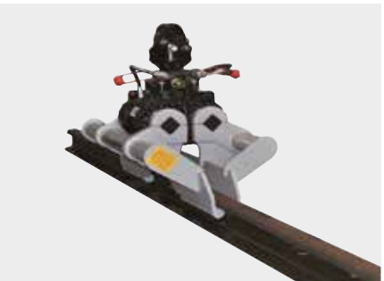
Rail grabs To handle rails and sleepers Rail grabs allow you to pick up longer rails positioned close to each other. Rail grabs are also suitable for handling sleepers.