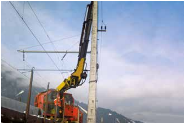
Mast erection made easy Whether lightweight masts or heavy concrete masts – no task is too hard for a PKR crane.

Ideal for overhead line construction thanks to the reverse outer boom.