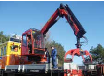
Timber grabs To position sleepers and railway elements The timber grab is used when handling railway sleepers and short railway elements.