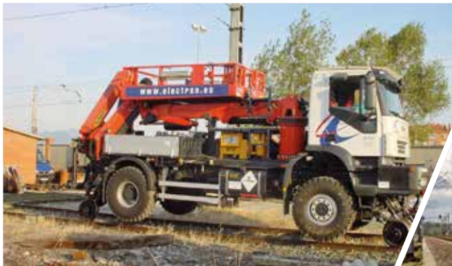
PA95 & PK16502 in Spain

Rapid and safe access to all positions in the overhead line and power supply system.