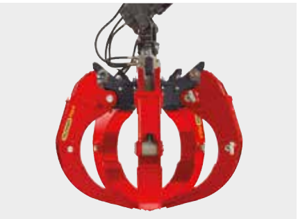
Polyp grabs Multifunctional device PALFINGER offers a wide range of multi-arm grabs for handling waste and scrap. Available with 4, 5 or 6 grab arms and with full-length arms, half-length arms or arms with grab tips.