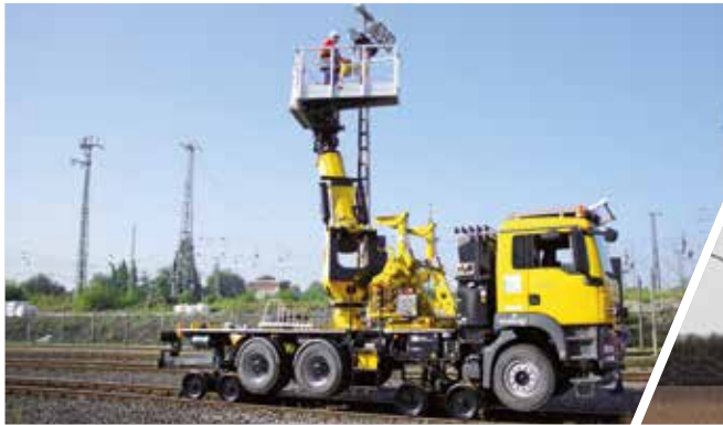
PA115 in Austria