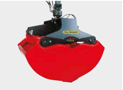
Bulk material grabs For track ballast, construction rubble and excavated earth The robust bulk material grab is ideal for transporting bulk materials such as track ballast, rubble and excavated earth, and can also be used for light-duty digging.