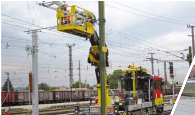
PA240 & PFD99 in Austria