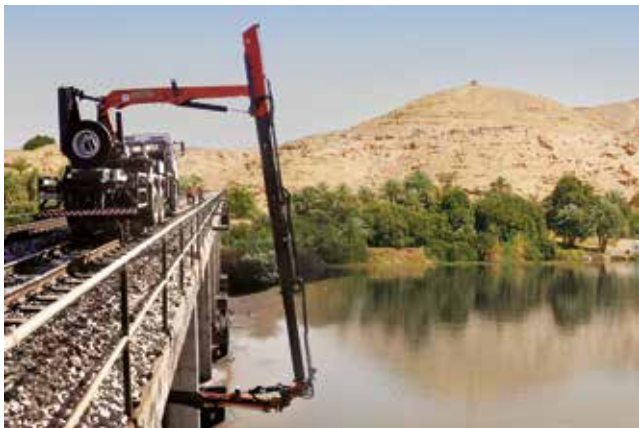
Can be used on many different carrier vehicles PALFINGER bridge inspection systems can be mounted on many different types of carrier vehicles. Their lightweight design means that they can also be used on lighter-duty carrier vehicles. This means that they can be deployed more quickly without compromising on the necessary stability.