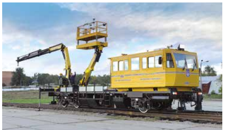
PA120 & PK26502 in the Ukraine