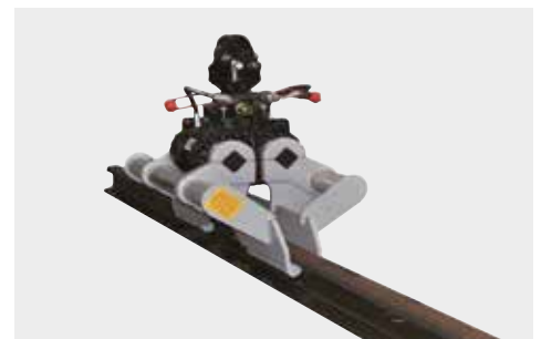
RAIL GRABS TO HANDLE RAILS AND SLEEPERS

PALFINGER offers a wide range of multi-arm grabs for handling waste and scrap. Available with 4, 5 or 6 grab arms and with full-length arms, half-length arms or arms with grab tips.