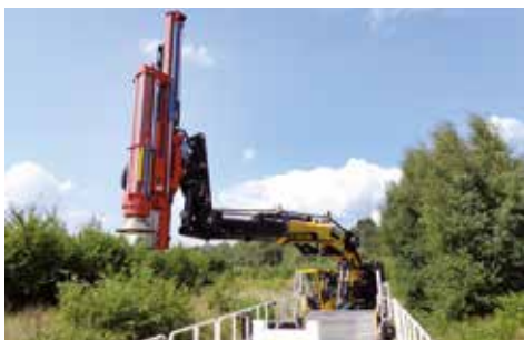
PILE DRIVERS TO DRIVE MAST FOUNDATIONS INTO POSITION

Ideal for preparing foundations for masts of overhead cables and signaling systems. The augers are available in different diameters.