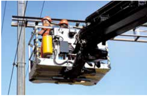
WORKMAN BASKETS FOR WORKING ON OVERHEAD WIRING

Workman baskets are an ideal tool, especially for working on catenary systems. Fixed or slewable workman baskets are used depending on the field of application.