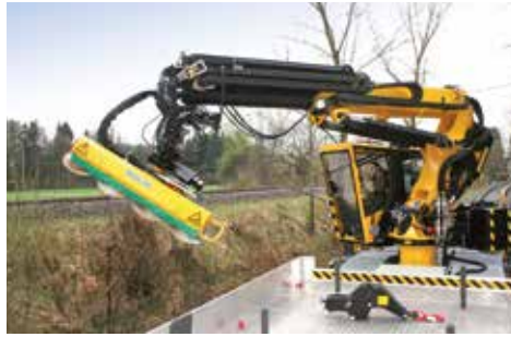
BRANCH SAWS TO CUT THE STRUCTURAL CLEARANCE OUTLINE ALONG THE LINE

Workman baskets are an ideal tool, especially for working on catenary systems. Fixed or slewable workman baskets are used depending on the field of application.