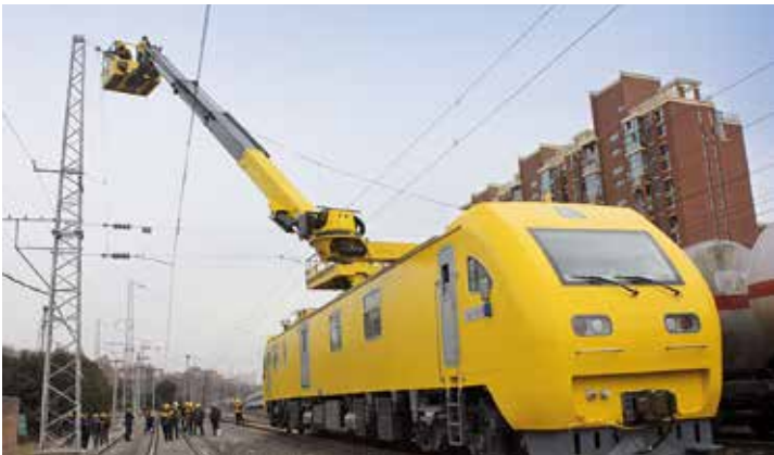
PA360 & PA95 & PFD99 in China