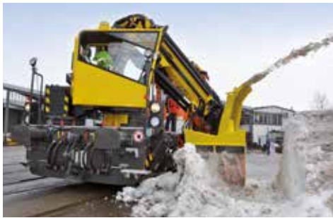
SNOW BLOWERS TO CLEAR AREAS OF SNOW

The use of mulchers to remove vegetation is both efficient and environmentally friendly.