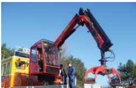
TIMBER GRABS TO POSITION SLEEPERS AND RAILWAY ELEMENTS

The robust bulk material grab is ideal for transporting bulk materials such as track ballast, rubble and excavated earth, and can also be used for light-duty digging.