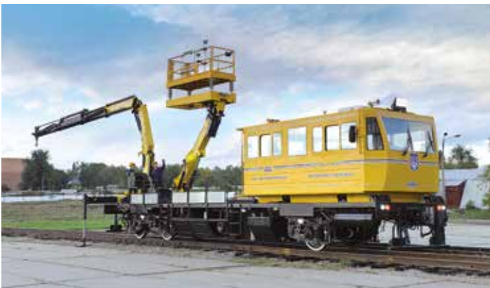
PA120 & PK26502 in the Ukraine