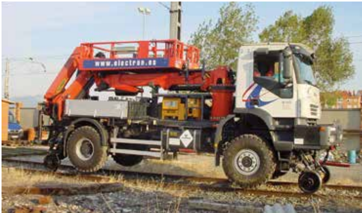
PA95 & PK16502 in Spain