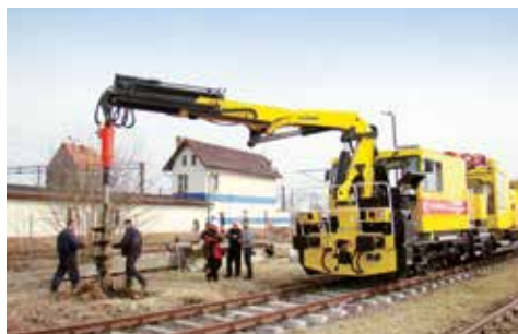
AUGERS TO PREPARE MAST FOUNDATION HOLES

Ideal for preparing foundations for masts of overhead cables and signaling systems. The augers are available in different diameters.