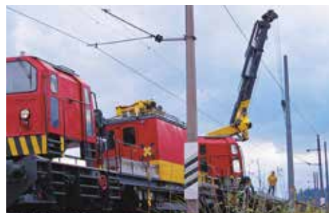
CABLE WINCHES TO IMPROVE HANDLING OF PARTS

Various types of pile drivers (impact or vibration type) can be fitted to suitable crane models to ram mast foundations into position.