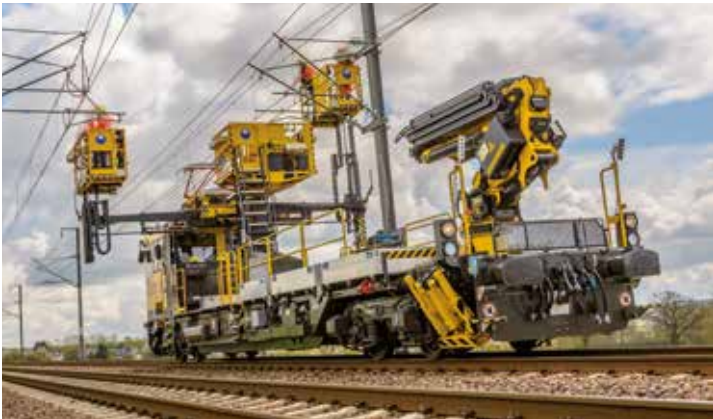
PA1002 & PR220 & PFD99 in Luxembourg