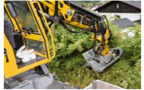
MULCHERS TO REMOVE VEGETATION ALONG THE LINE

Branch saws or even branch shears allow the clearance outline to be cut. The cabin offers optimum protection for the operator.