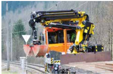
CLAMSHELL BUCKETS TURN A CRANE INTO A VERSATILE MACHINE

Snow blowers fitted on the crane boom enable surfaces and paths alongside the vehicle to be cleared.