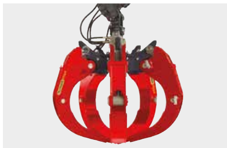
POLYP GRABS MULTIFUNCTIONAL DEVICE

The timber grab is used when handling railway sleepers and short railway elements.