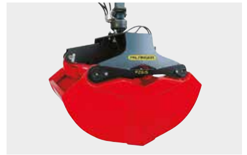
BULK MATERIAL GRABS FOR TRACK BALLAST, CONSTRUCTION RUBBLE AND EXCAVATED EARTH

The universal clamshell bucket is ideal for day-to-day digging and loading applications.