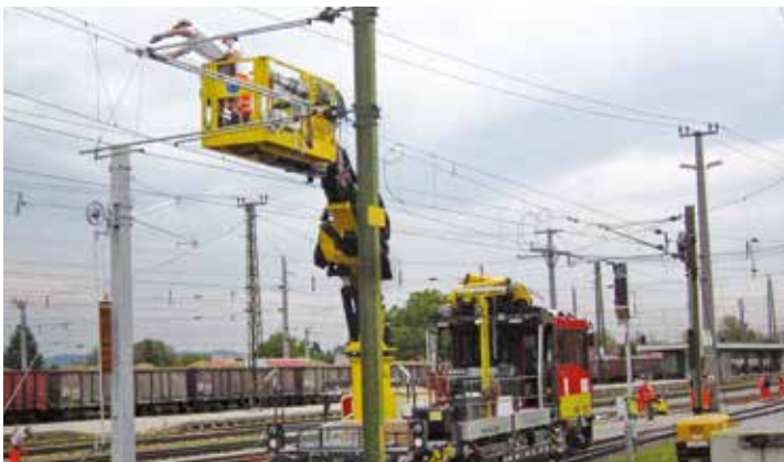
PA240 & PFD99 in Austria