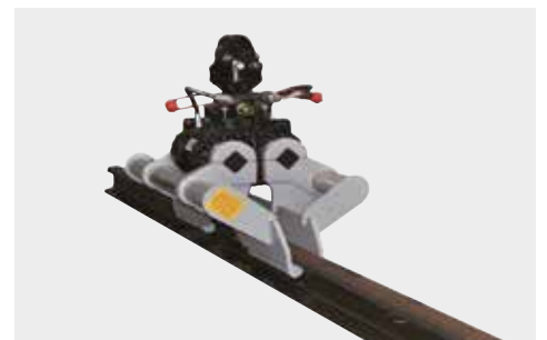
RAIL GRABS TO HANDLE RAILS AND SLEEPERS

PALFINGER offers a wide range of multi-arm grabs for handling waste and scrap. Available with 4, 5 or 6 grab arms and with full-length arms, half-length arms or arms with grab tips.