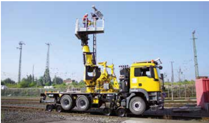
PA115 in Austria