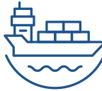
MERCHANT | CARGO